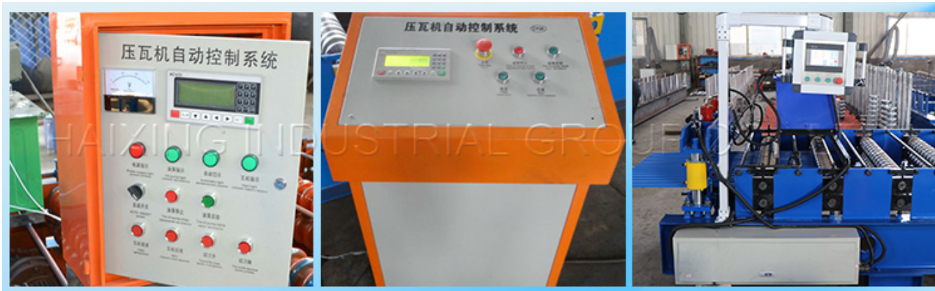
Roll forming parts and Output table: