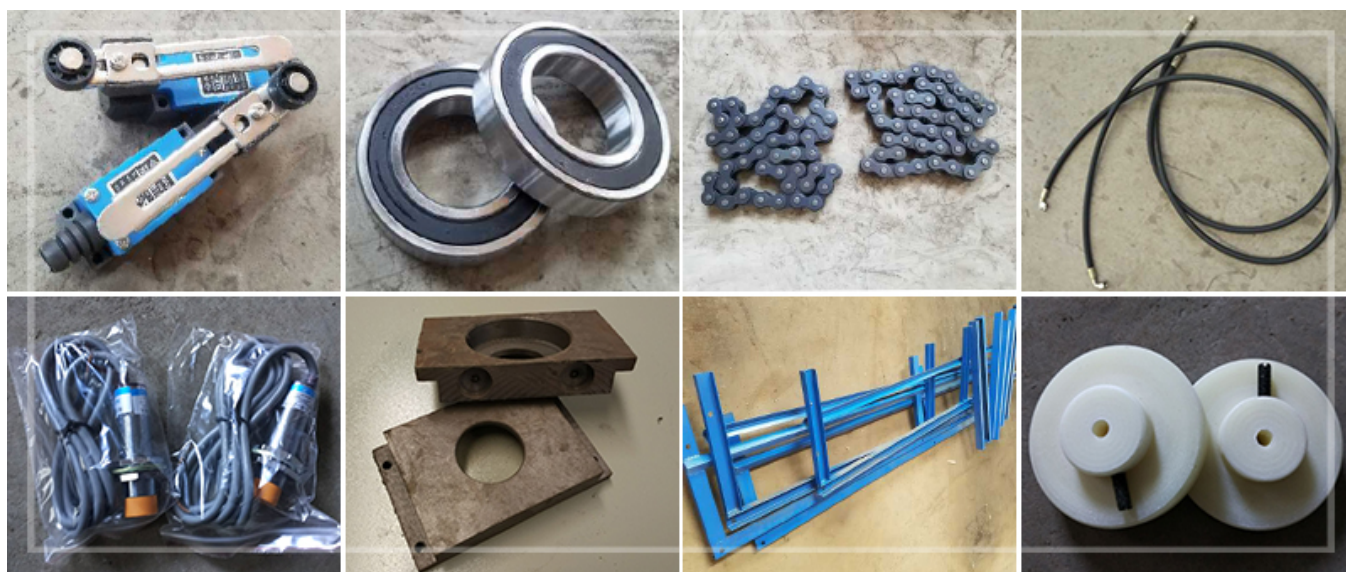
Detail display of the automatic roofing tile roll forming machine parts

We offer our customers easy-broken parts for free.